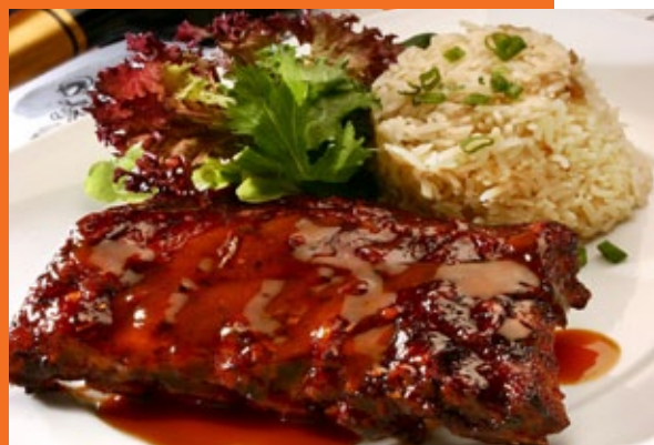
BARBEQUED BABY RIBS