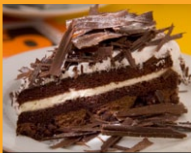
FRUIT OF THE FOREST