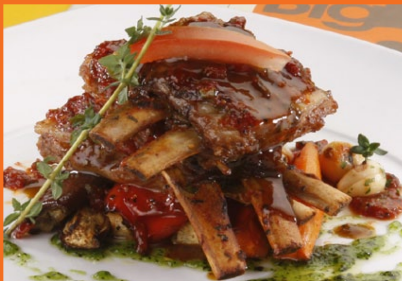
SLOW-COOKED LAMB SHORT RIBS WITH MINT JELLY