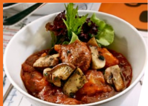
Big O's Most FAMOUS BEEF STEW