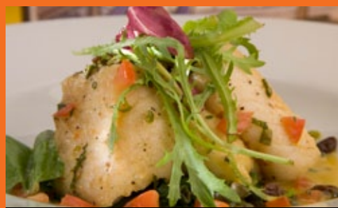
PAN-FRIED COD FISH FILLET