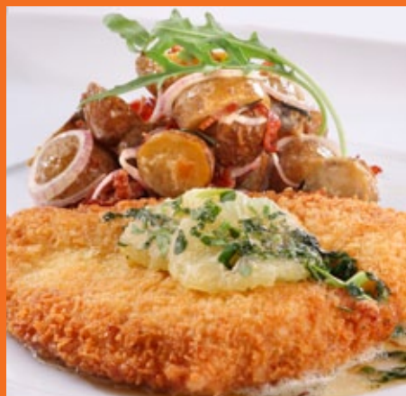
BREADED CHICKEN SCHNITZEL