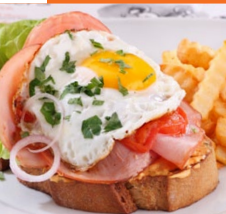
HAM & EGG SANDWICH