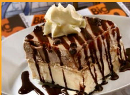
BigO's BAILEYS MUDPIE