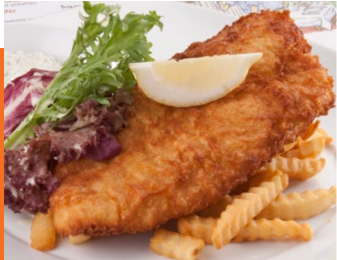
CRISPY FRIED FISH & CHIPS