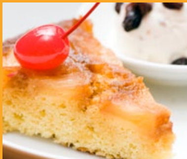
WORLD TURNED UPSIDE-DOWN